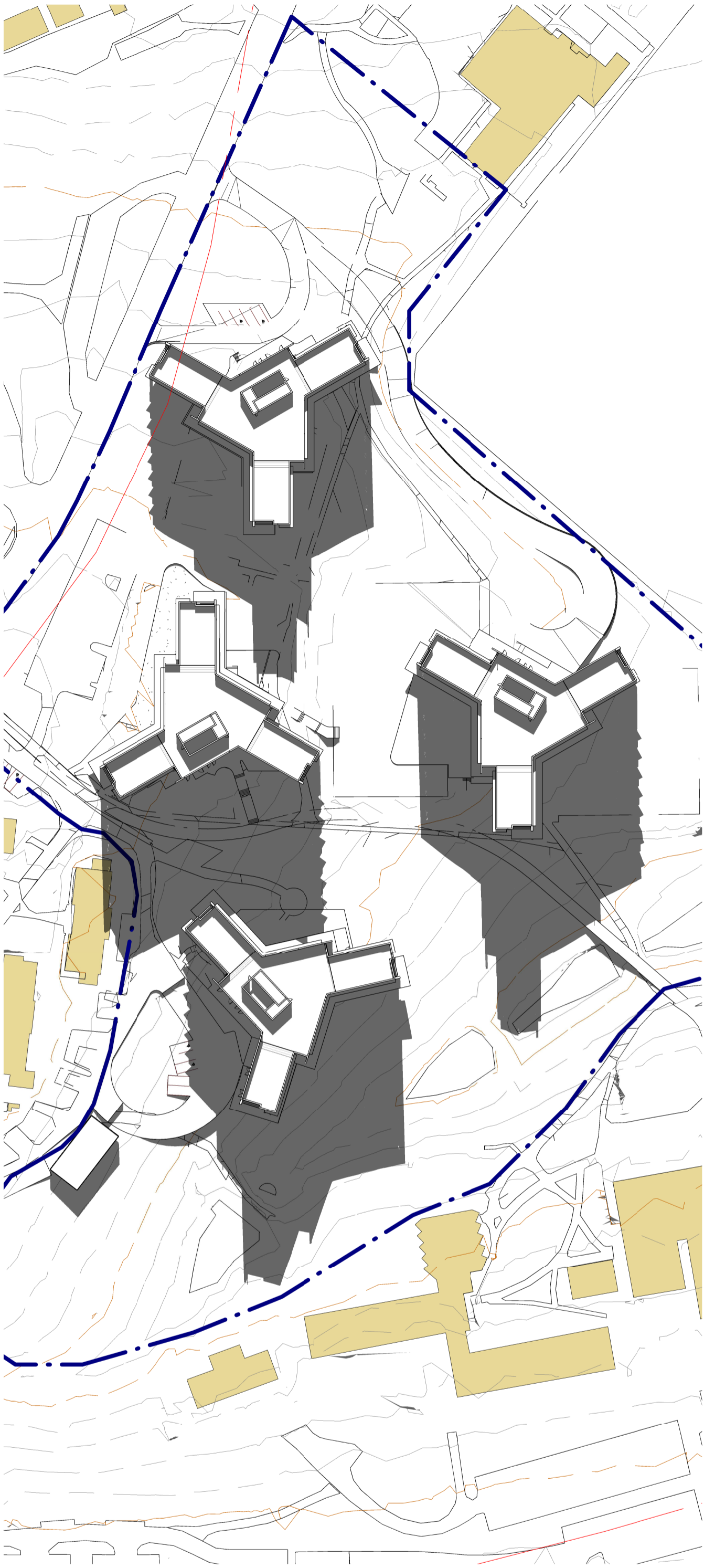
2 12 Noon 21st June Scale: 1 : 1000